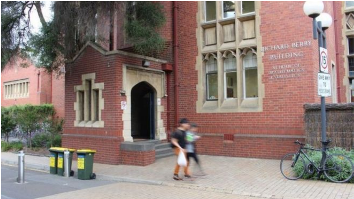
Richard Berry Building has been rebranded to a less controversial figure