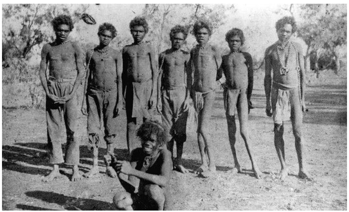
The pastoralists might've had their euphemisms - such as "dispersal", when what they really meant was killing.'

Photographs of Indigenous men and boys in chains give testament to a system of brutal slavery in the early 1900s. They are yet another symbol of continued oppression