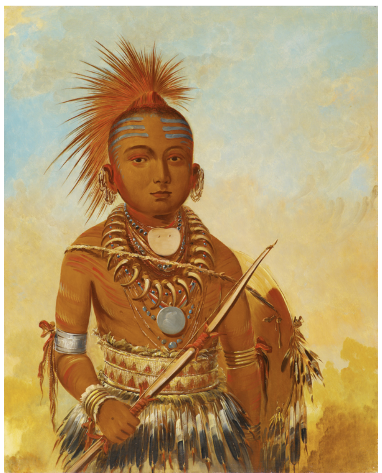
George Catlin, Portrait of Wa-ta-we-buck-a-nak, c.1846, oil on canvas, 81 x 65 cm.

Cambridge's Museum of Archaeology and Anthropology were founded as, essentially, cabinets of curiosities that, in turn, took their cues from 17th- and 18th-century 'royal collections', which themselves can now be found in English museums such as Oxford's Ashmolean Museum or London's British Museum.