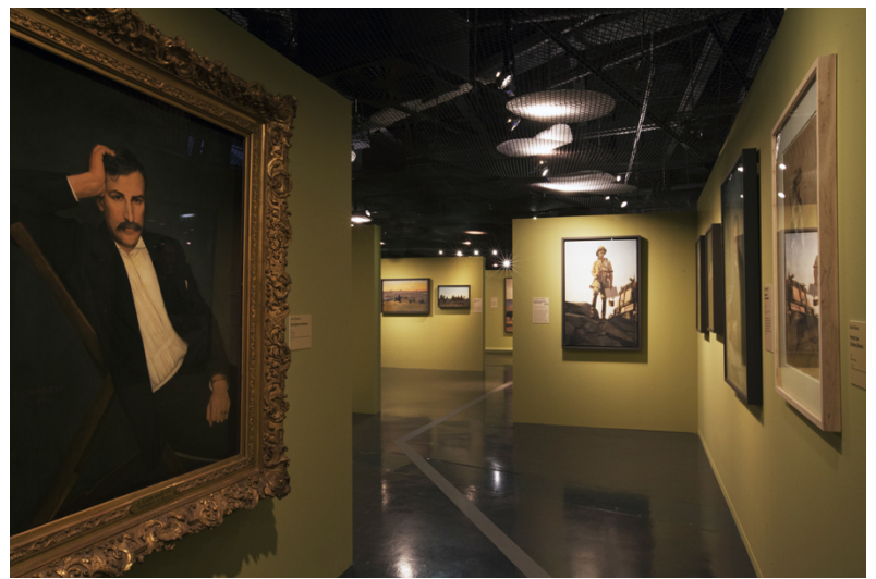
'Paintings from afar, the collection of the musée du quai Branly - Jacques Chirac', installation view, musée du quai Branly – Jacques Chirac, 2018.

The quai Branly could still return to Chirac and Godelier's hopeful ideals and change the perspective of the museum so that the works of former colonies are viewed from a perspective other than that of the colonizer. What if Europe was not the ultimate focal point of history and art but rather just one point among many? The only way for the ethnographic museum to survive, as Singh also noted in her speech, is for 'Enlightenment Europe ... to appear as an ethnic particular.'