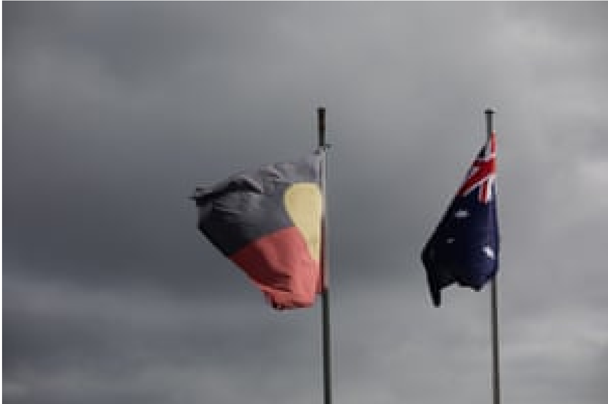
The Aboriginal and Australian flags flying in Bargo