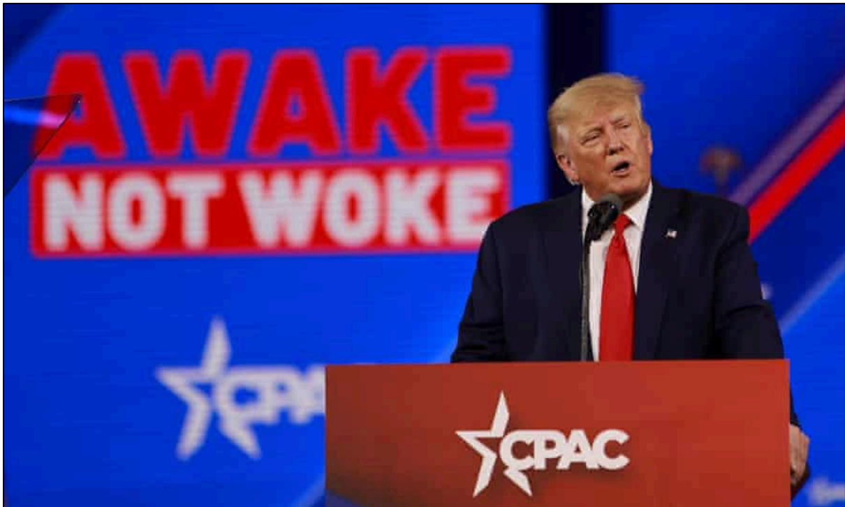
Donald Trump speaks during the Conservative Political Action Conference (CPAC) in Florida.

Dugin's ideology is steeped in Russian Christian nationalism and has chimed with Putin's world view. At the same time, it echoes much of the Christian nationalist activism in the US, where liberal values, gay rights and a desire to keep religion out of the state, are seen as decadent and responsible for American decline.