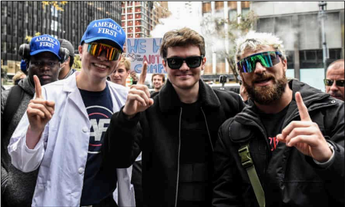
Nicholas Fuentes flanked by anti-vaccine protesters at a demonstration in New York.

The three-year-old conference sees itself as part enfant terrible, piquing the genteel wing of the Republican party, and part Weimar-era beer hall organizing before the putsch. It is far right, but no longer on the fringe of Republican politics.