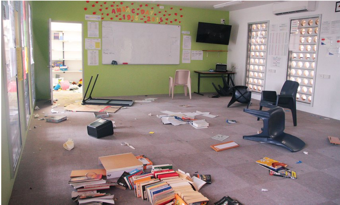
Inside the damaged Don Dale detention facility.