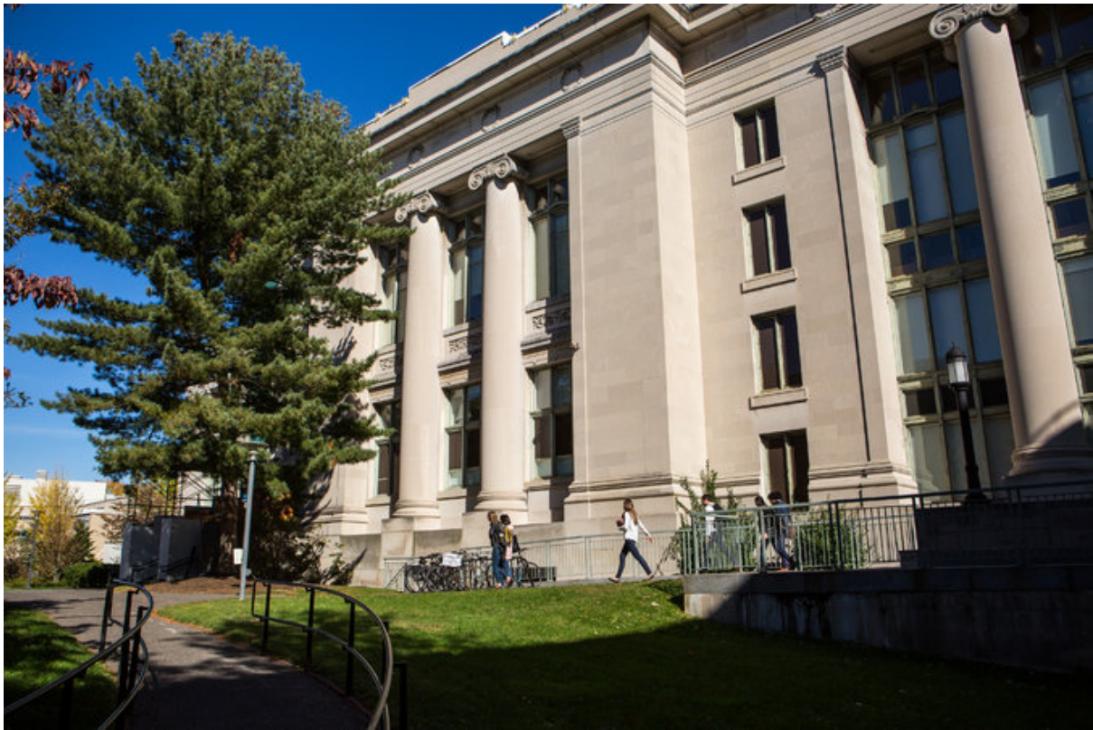
The Harvard Law School Library in Cambridge, Mass.

Harvard Law School is poised to abandon an 80-year-old shield based on the crest of a slaveholding family that helped endow the institution, as campuses across the country debate the use of historic names and symbols that some consider offensive.