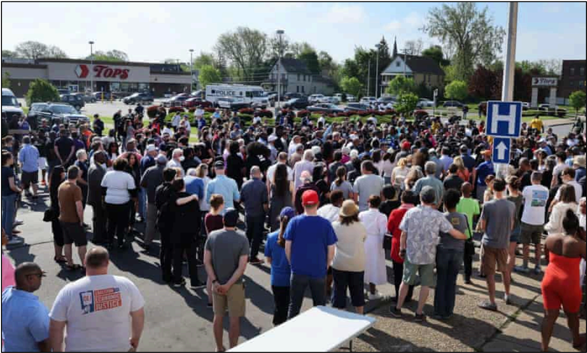
People gather outside of Tops market on Sunday in Buffalo, New York, after a gunman opened fire at the store, killing 10 people and wounding another three on Saturday.

“It seems that he had come here to scope out the area, to do a little reconnaissance work on the area before he carried out his just evil, sickening act.”