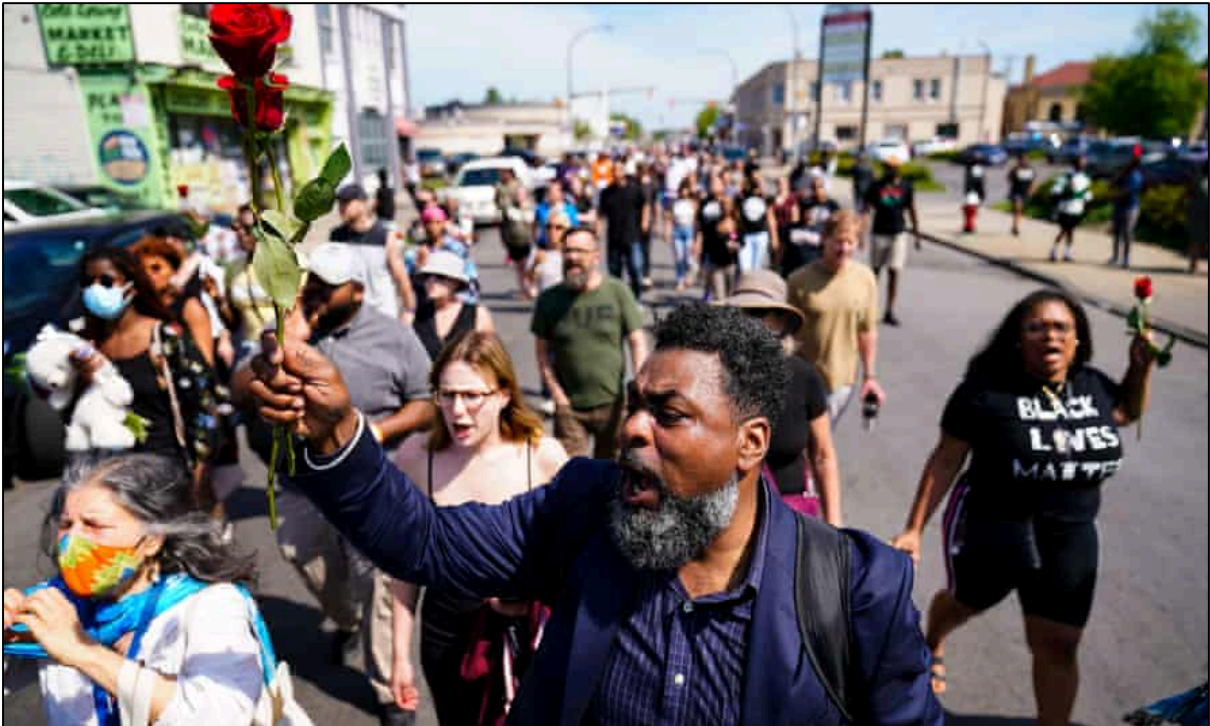
People march to the scene of a shooting at a supermarket in Buffalo, on Sunday.

for in America. Hate must have no safe harbor. We must do everything in our power to end hate-fueled domestic terrorism.”